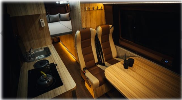
Picture 3. Kitchen area