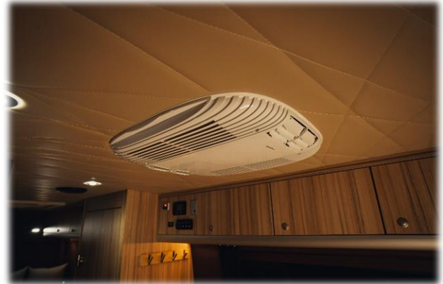
Picture 6. A/C Unit