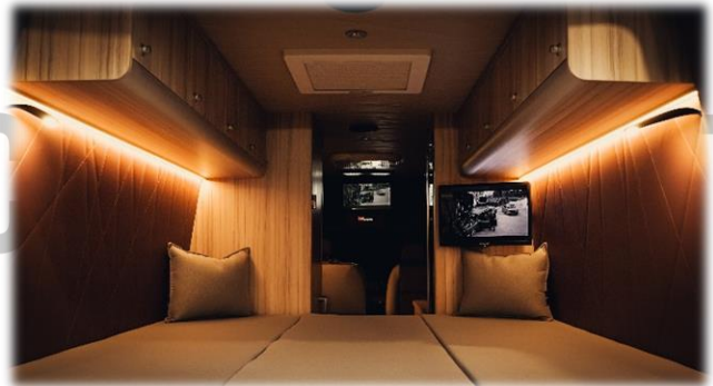
Picture 4. Sleeping area in back