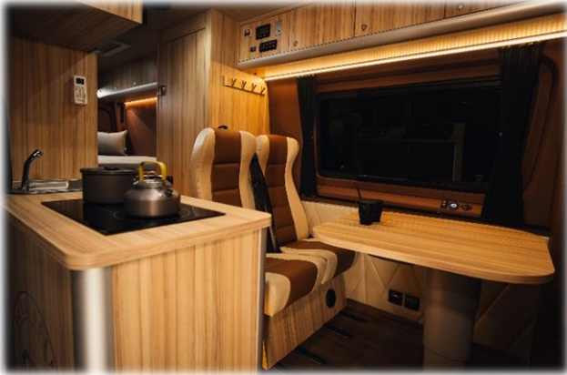
Picture 1. Interior colors and layout