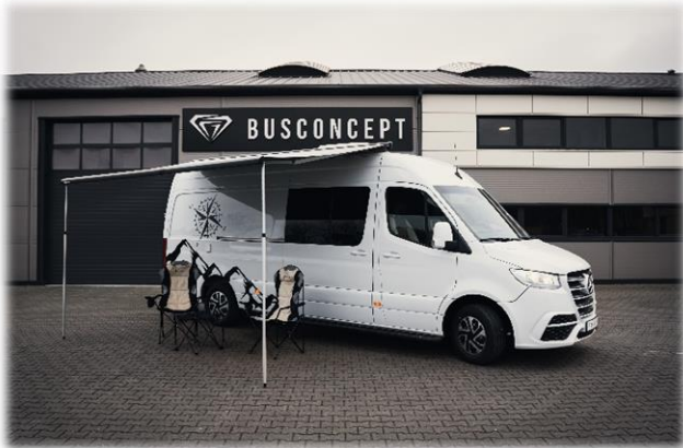
Picture 5. Outside design