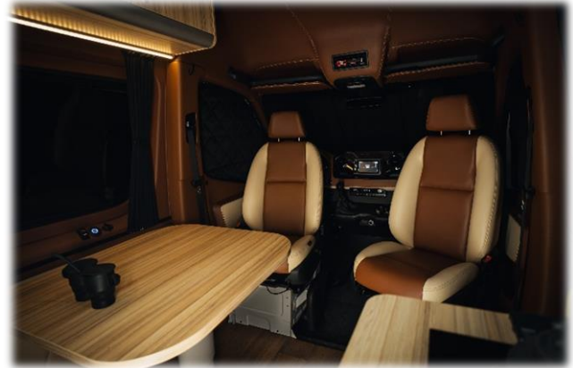
Picture 2. Swivel front seats